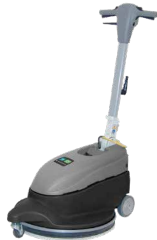
TE9007349 BR-2000-DC High Speed Burnisher