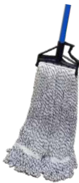
2175411 Finish Mop