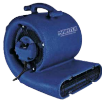
MX900000 Air Mover

To begin the process, gather all the necessary supplies, which may include: