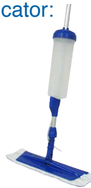
225568 Bucketless Mop w/Mop Pad

If using a microfiber finish applicator: