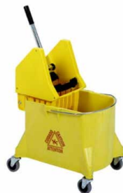
23570932 Bucket/Wringer Combo

If using a microfiber finish applicator: