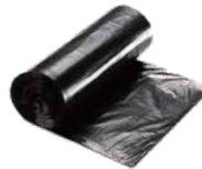
248153 Trash Liner