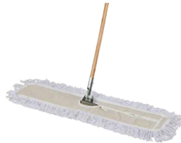
261536 36" Dust Mop Complete